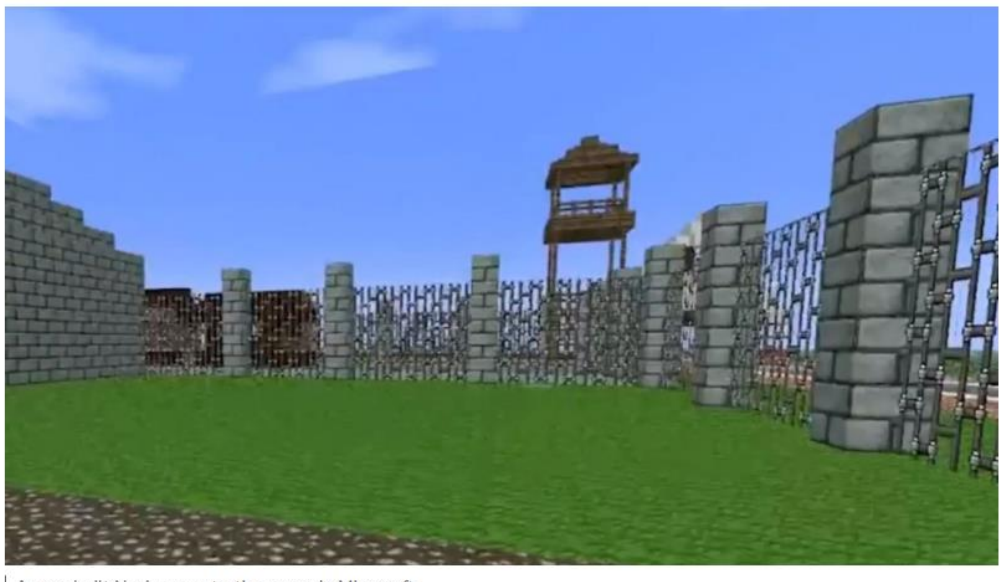
A user-built Nazi concentration camp in Minecraft

Extremists are using mainstream video games and gaming chat platforms to spread hate, BBC Click has found.